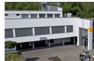
LUNCH – OASE