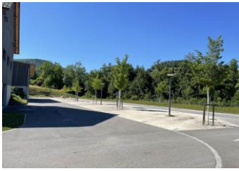
TROTTE CAR PARKING