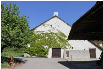
10 th ANNIVERSARY PARTY TROTTE EVENT HALL