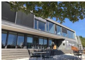
REGISTRATION PARK INNOVAARE