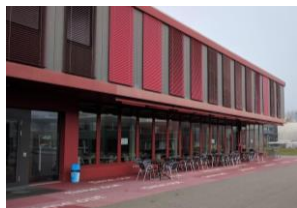
TALKS WBGB/019 CONFERENCE ROOM